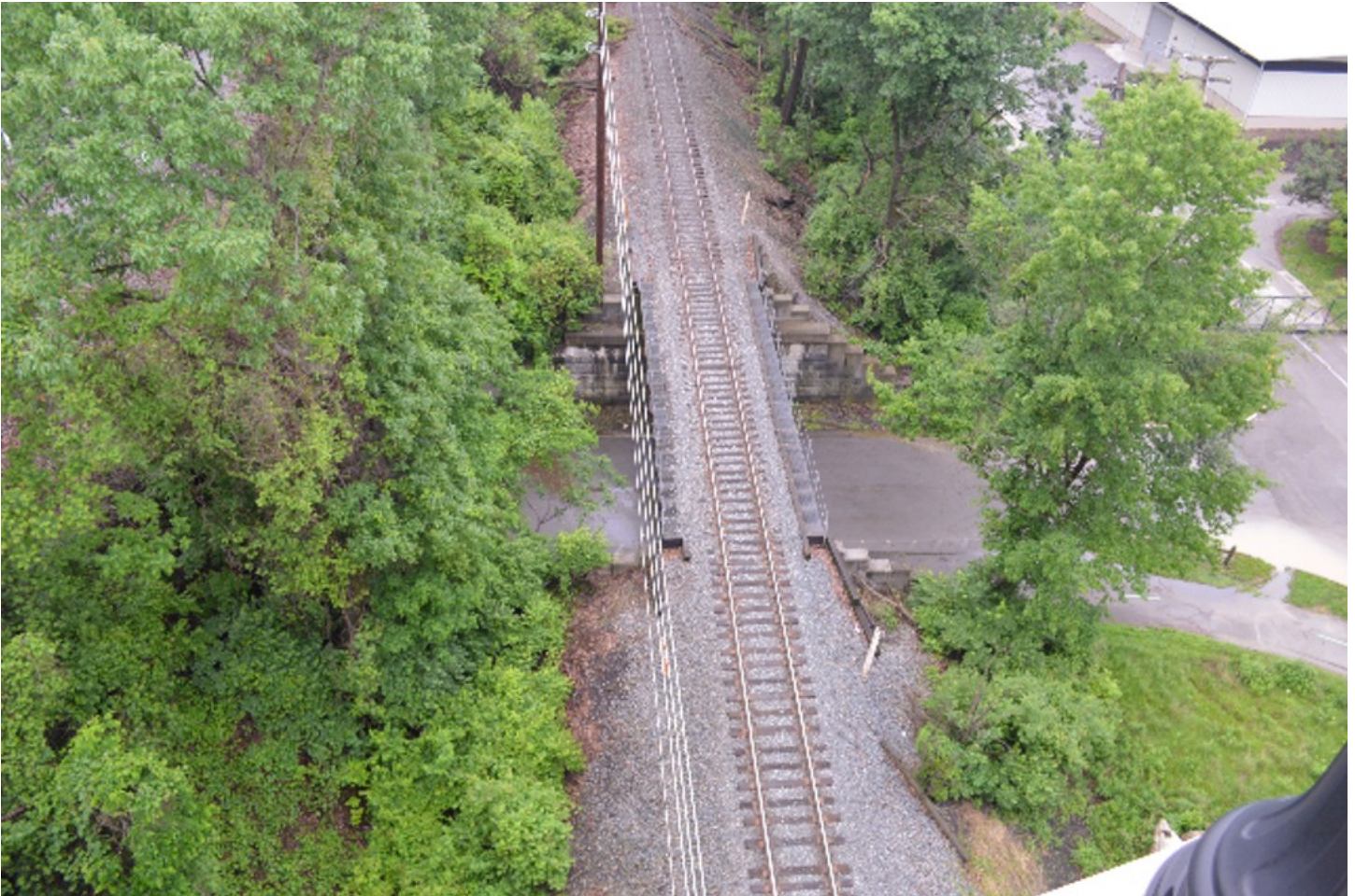
The B&O tracks seen here go under the Fulton Road bridge. Left and out of sight are the W & LE tracks.