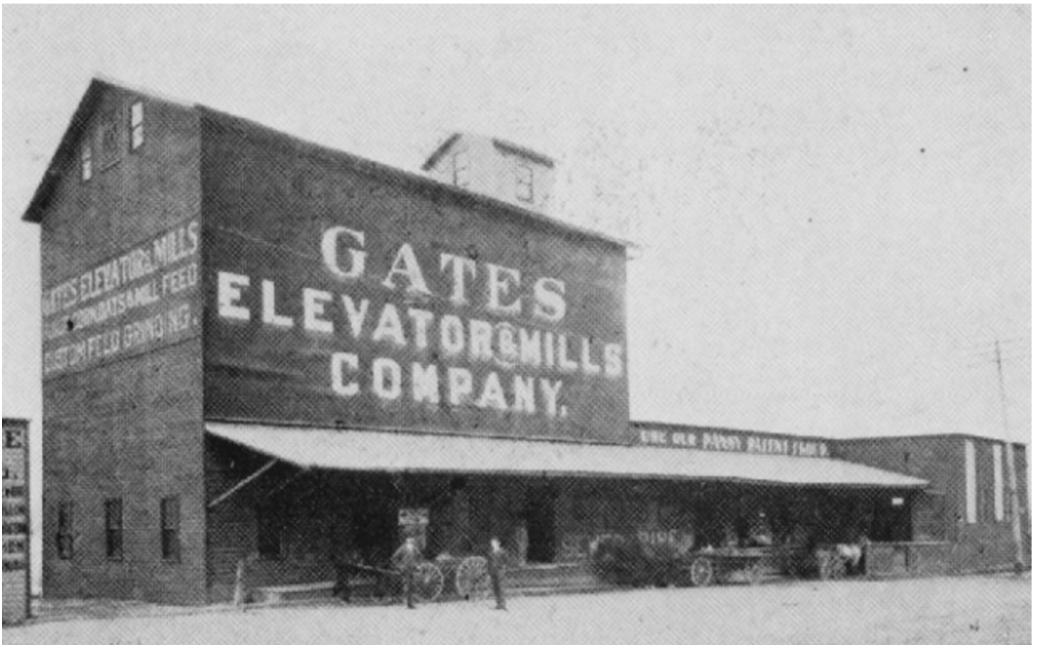
The Gates Elevator & Mills Company was on the south end of the bridge.